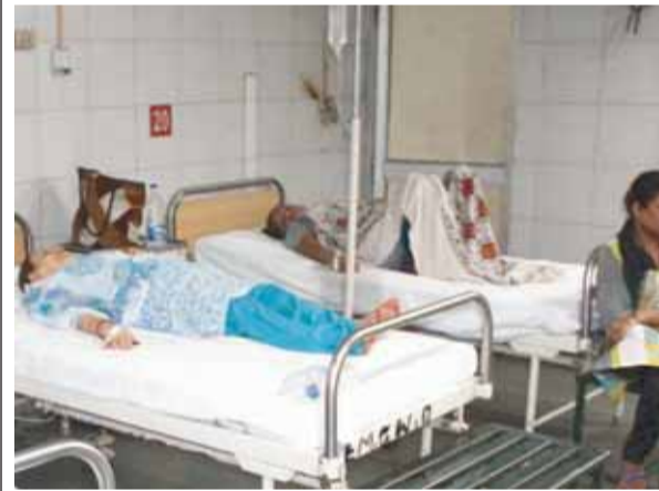
Women admitted to Civil hospital after they fell on Monday